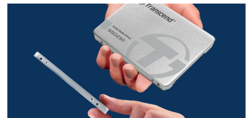
Ultra-slim 6.8mm form factor