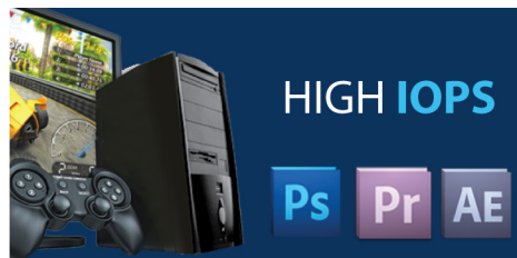
Faster load times & lag-free multitasking

Transcend's SATA III 6Gb/s solid state drives deliver significantly improved performance and reliability to modern Ultrabooks, notebooks, and desktops. Designed with multitasking power users in mind, the productivity-enhancing SATA III SSDs are the ideal upgrade solution for advanced multimedia computing and intense gaming.