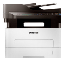
SL-M2885FW 28PPM Mono Multifunction Laser ...

Features and specifications are subject to change without prior notification.