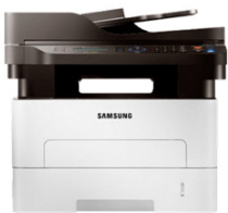
SL-M2885FW 28PPM Mono Multifunction Laser ...