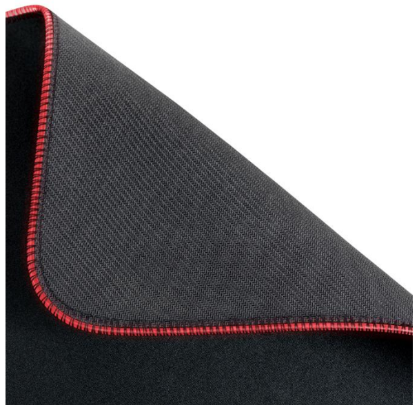
Non-slip Rubberized Base