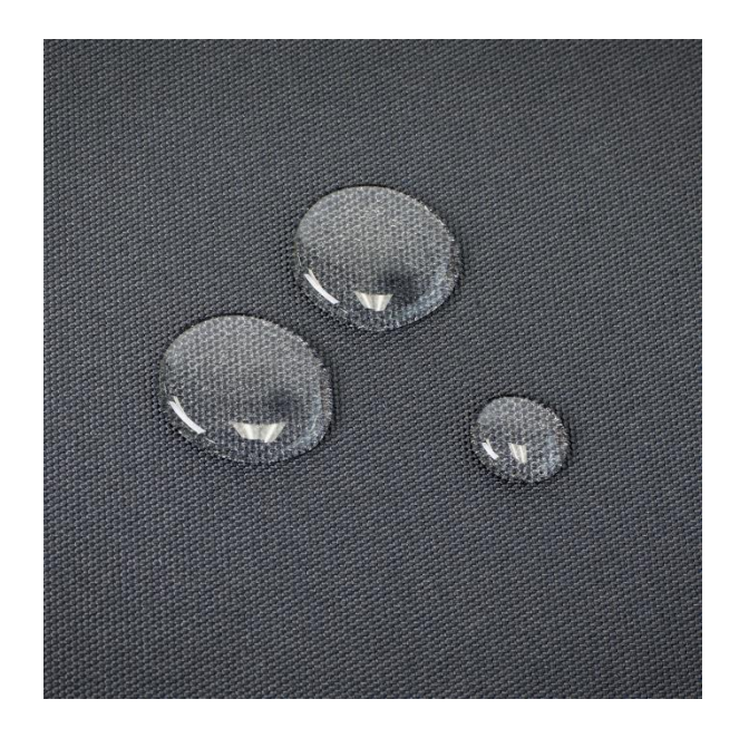
Splash proof fabric