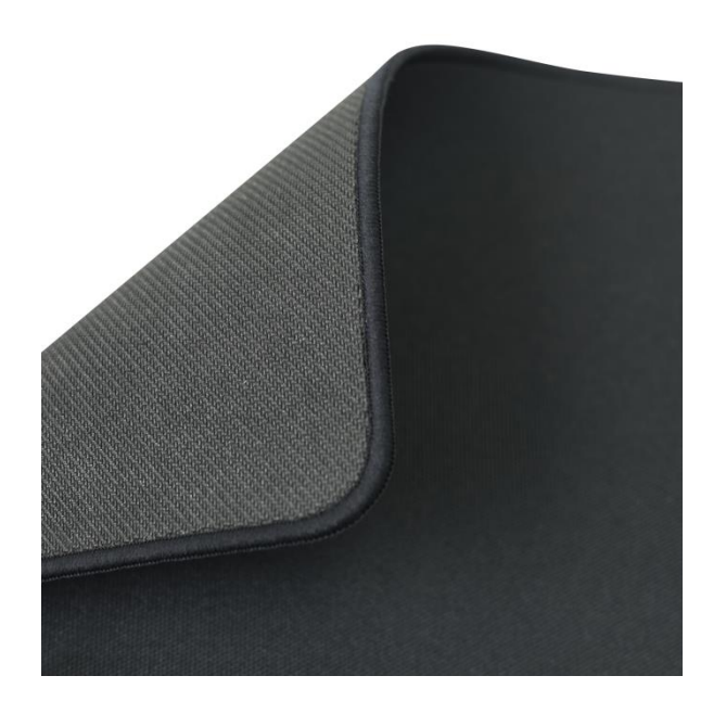
Anti-slip rubber base