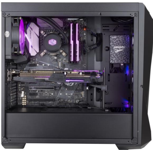
Just some example