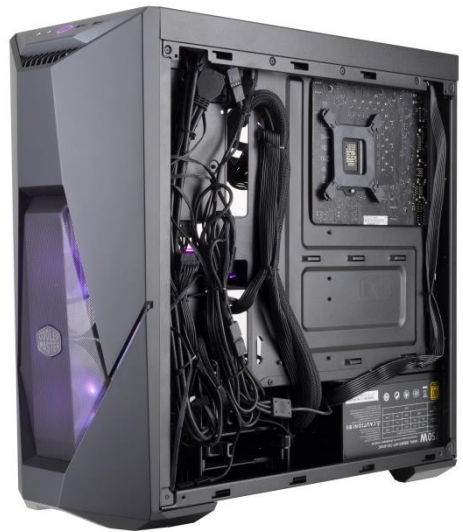
Just some example