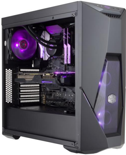
Just some example