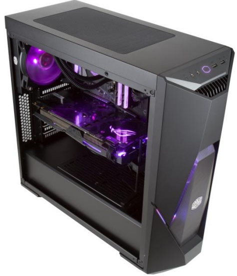
Just some example