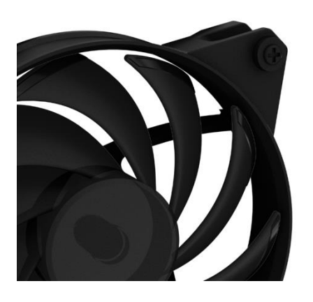
MasterFan Pro 120 Air Balance with perfect balance of noise and performance