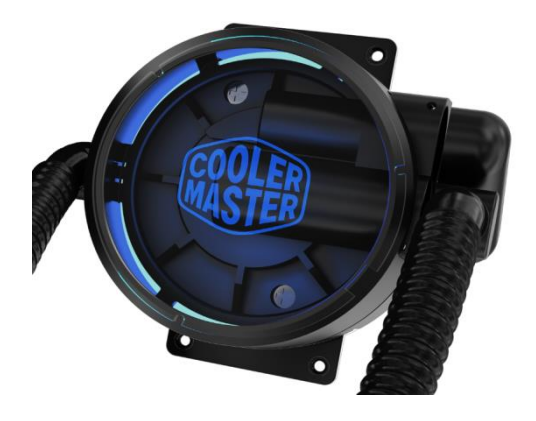
Elegant blue LED illumination on the top of water block