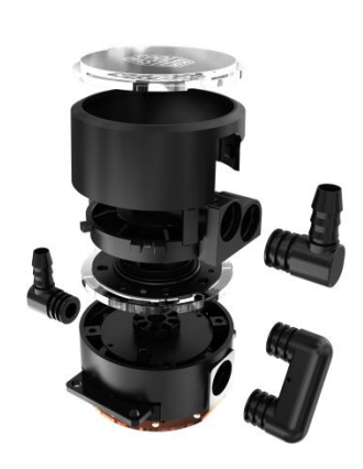
Exclusive dual chambers design to improve the performance and lifespan of pump