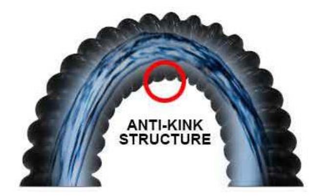
The FEP tubing allows maximum, unrestricted waterflow and decreased evaporation rate for greater durability