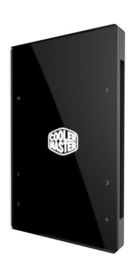
Or 2) require RGB control box ( sold separately)