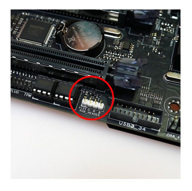
1) Require motherboard with RGB header to enable RGB lighting