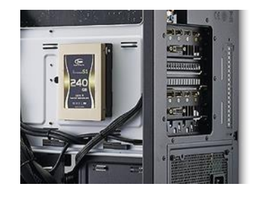
SSD can also be installed behind the motherboard tray