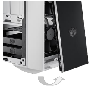
Easy fan installation without removing the full front bezel, but simply by removing the front panel