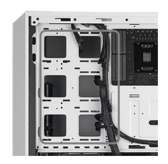
Six routing holes for any system configuration