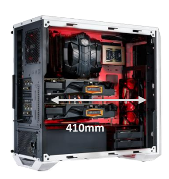
Supports graphic card up to 410mm in length