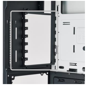
Convenient opening for easy graphic card(s) installation